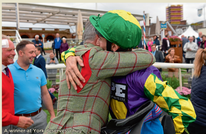
A winner at York deserves a hug