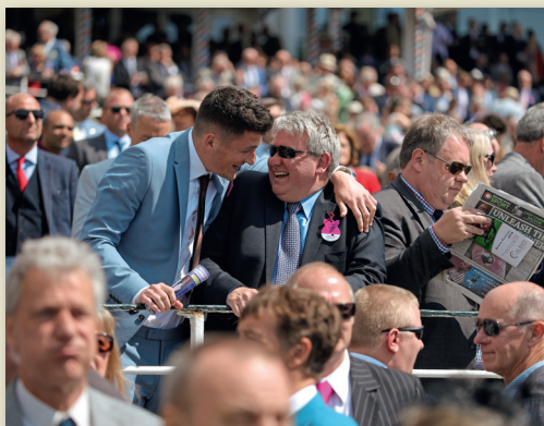
Racing Post Readers Award Winner 2019*