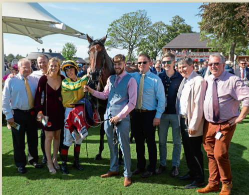
ROA Gold Standard Racecourse of the Year 2019*