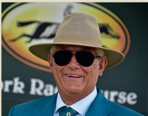
Customer Service, Casual Dining & Signage & Orientation - Live Tourism Excellence Awards