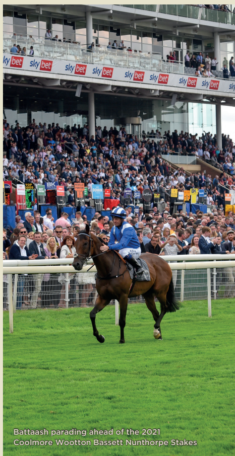
Battaash parading ahead of the 2021 Coolmore Wootton Bassett Nunthorpe Stakes