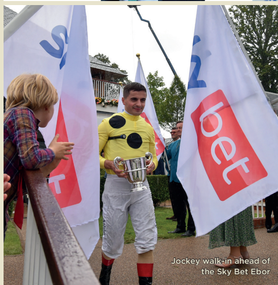
Jockey walk-in ahead of the Sky Bet Ebor