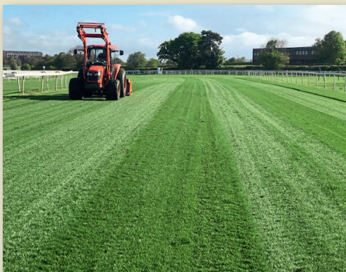
Racecourse Association Groundstaff Champions 2019*