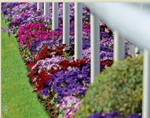
Visitor Attraction Gold Award - RHS Yorkshire in Bloom Awards