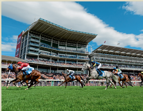
Racecourse of the Year winner 2019* - voted by members of the Racegoers Club for the last 4 years