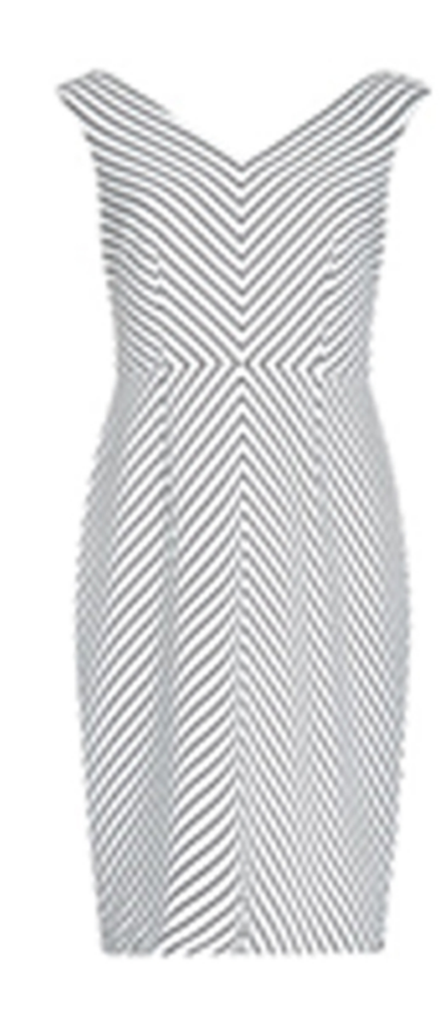
Adrianna Papell striped dress £115.00, and Anthropologie earrings £44.00