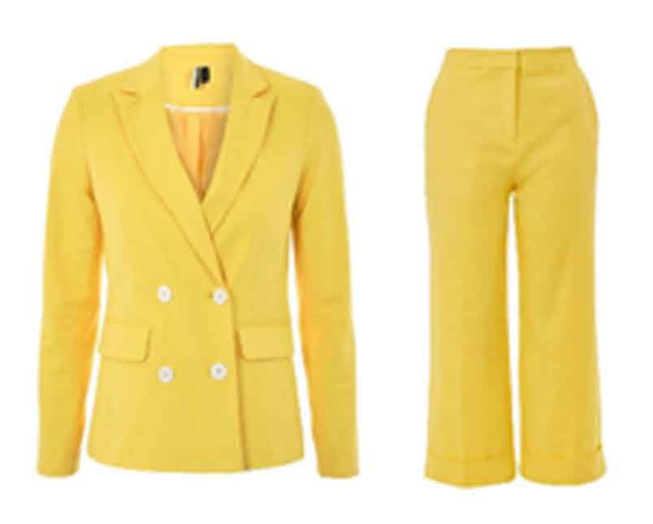
Topshop yellow suit jacket £60.00 and cropped trousers £40.00

Wrap dresses are popular this season, they can be paired with a large navy floppy hat and wedges for a laid back, chic look. Look out for dresses with frills and oriental patterns, other key trends this year.