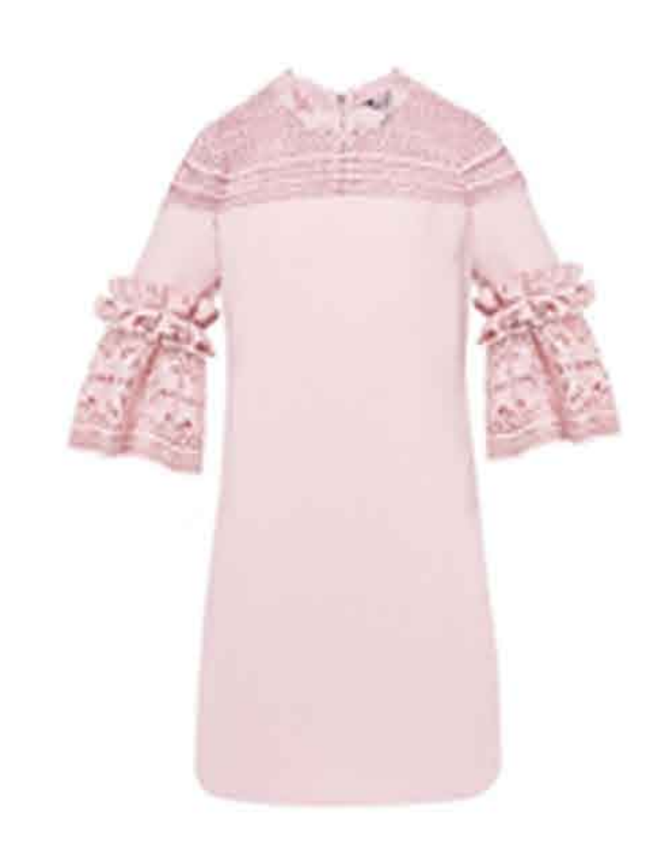
Ted Baker pastel pink dress £186.75