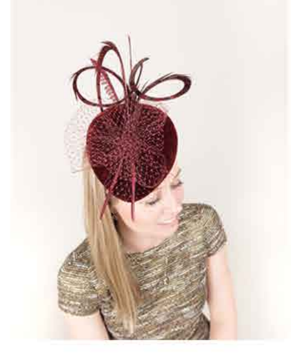
Hats above by George Durdy

If you invest in a well-made hat or headpiece that you love, the trimmings can be changed for you by a milliner. Your hat can take on a completely different look when the colours or materials being used are switched up. Alternatively, choose a neutral base that will go with any dress whatever the colour.