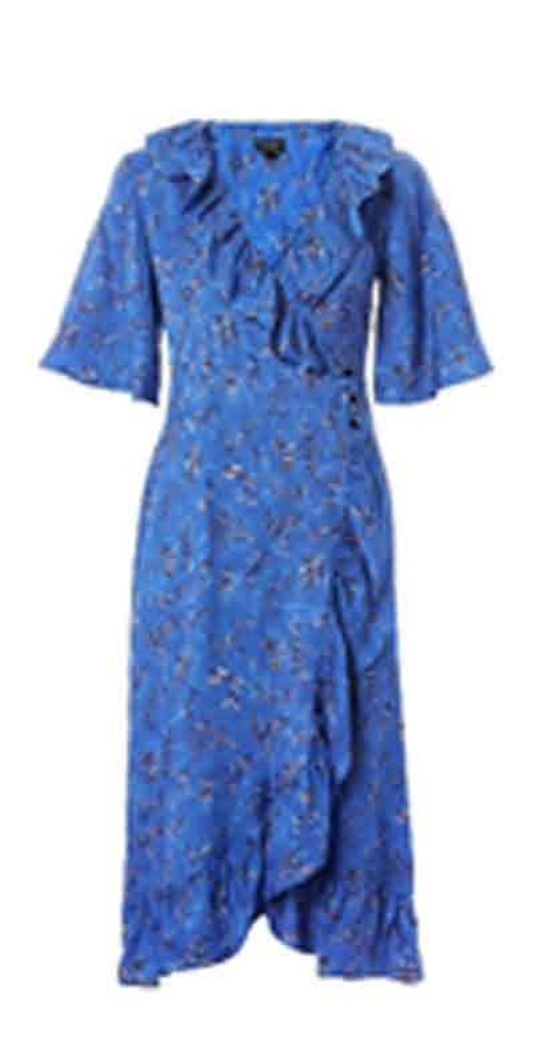
Topshop blue midi wrap was £46.00 now £35.00