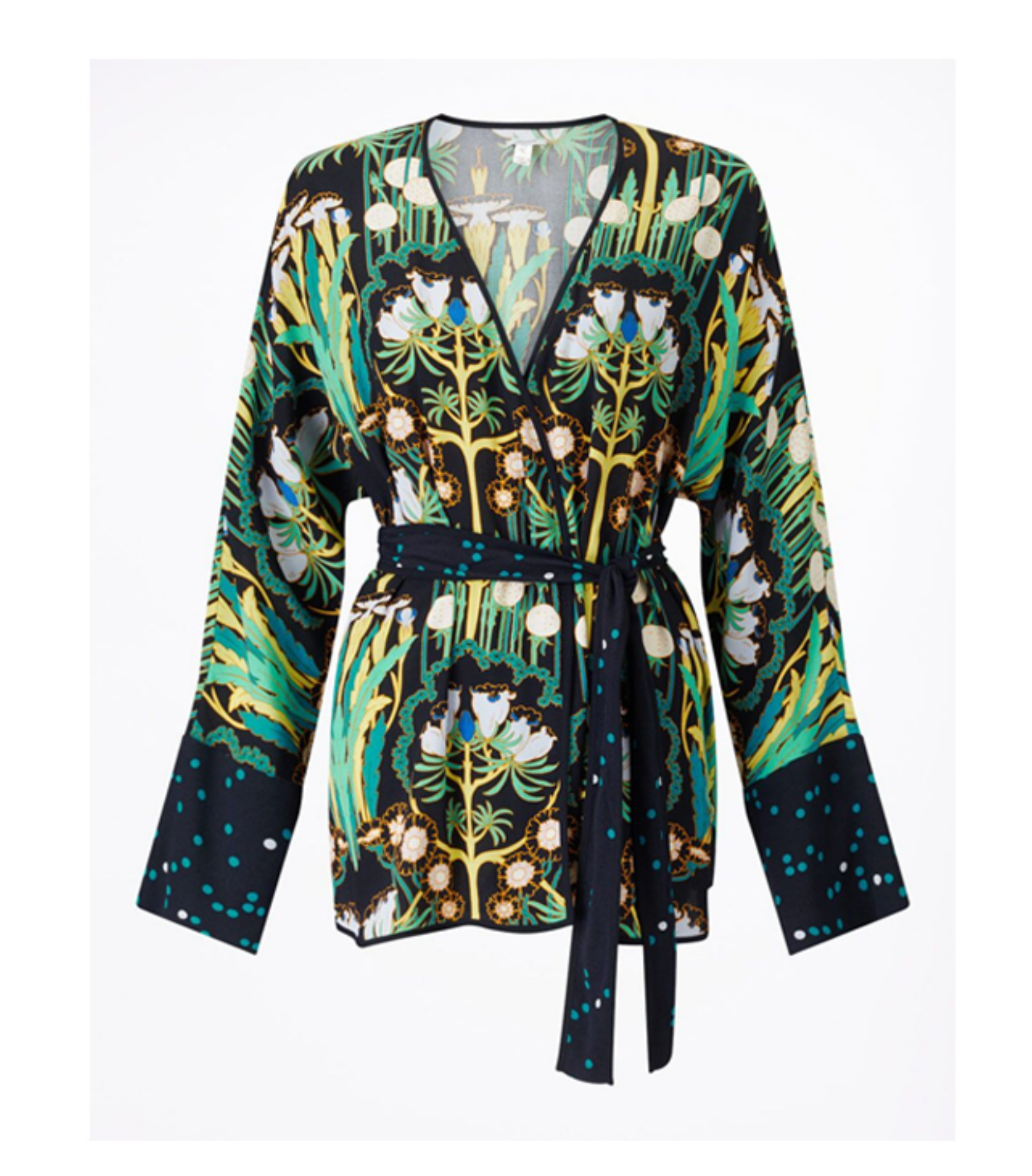
Jigsaw fuchsia trees kimono £120.00, and trouser £140.00

Still very much a trend this season are co-ords and two pieces, these are perfect for race meetings in the early months of the season. Layer them with a trench coat for a stylish and practical look.