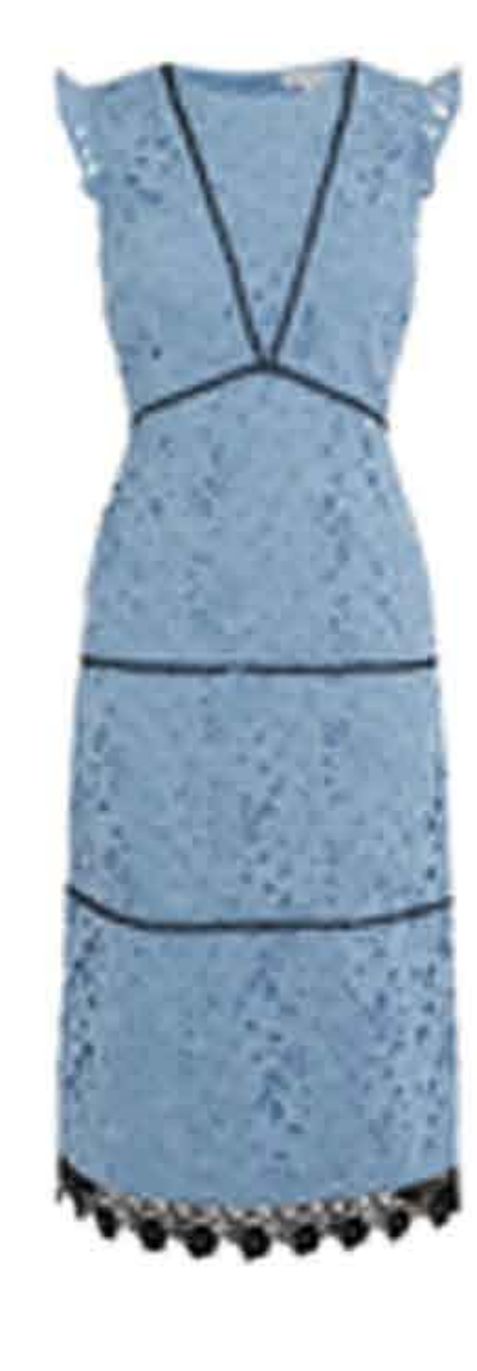
Warehouse pastel blue scallop hem lace dress £79.20