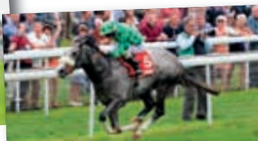
star performer on the Knavesmire-Chantilly-Leopardstown, The Grey Gatsby