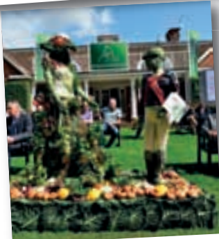
Some fashionistas struggled with the catwalk