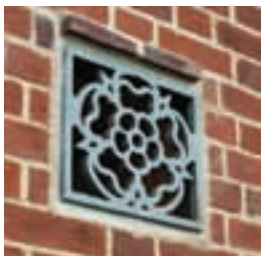
York hand-made made brick with lime mortar and white rose ventilation window