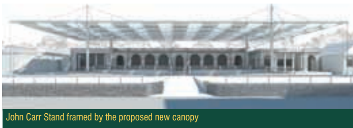
John Carr Stand framed by the proposed new canopy