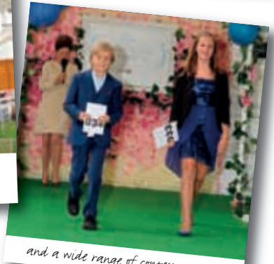
and a wide range of contestant ages