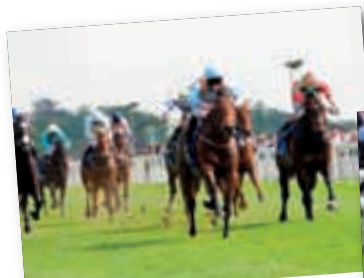
G Force - rags to riches