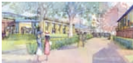
Future Moët Pavilion on schedule to open May 2015

The new Weighing Room building is a bespoke structure, complete with trade mark barber poles and metal fretwork, that we hope will become a welcome and familiar aspect of the Knavesmire skyline. The emphasis has been on quality and context for this important building and the structural materials are the same local handmade bricks with traditional lime mortar topped with Welsh slate which were used for the new saddling boxes. The work of renowned York blacksmith,