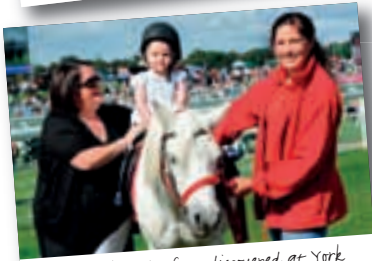
New talent is often discovered at York