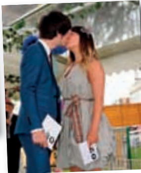
Ebor Fashion Lawn had a wide range of prizes