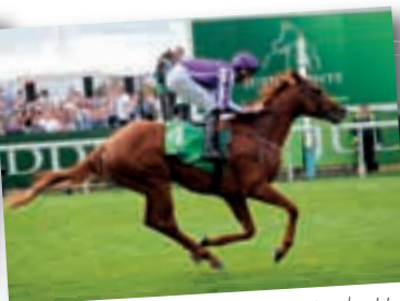
Victory in the Juddmonte International adds to dual Derby winner Australia's roll of honour