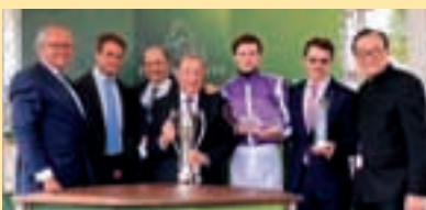
Connections of Australia celebrate his Juddmonte International Stakes win; the prize fund for this race will again be at a record level of £850,000 on Wednesday 19 August 2015