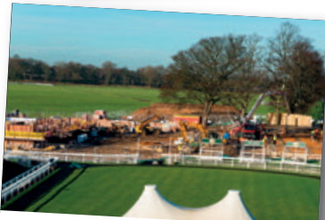
Former Northern End being taken apart