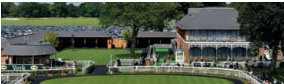
The new Pre Parade Ring with saddling boxes to west and north, new vet boxes in the top left corner and future weighing room and Parade Ring Restaurant under construction on the eastern boundary

The first floor of the Weighing Room is the Parade Ring Restaurant, overlooking the parade ring, saddling boxes and pre-parade ring it provides the ideal location for a raceday fine dining experience. With a dedicated entrance, welcoming, timber clad, main room with feature roof window, air conditioning and all the best in modern design it will be a fabulous base for a raceday. We are already taking bookings