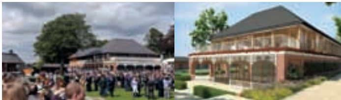
The future Weighing Room and Parade Ring Restaurant under construction (l) and the architect's impression of the finished article (r)

Our thanks to everyone on the project and build team including main contractor Lindum York, another few busy months lie ahead!