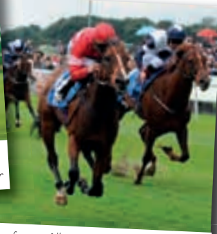
The fastest filly on Ladies Day Tiggy-Wiggy lands the Pincent Masons Lowther