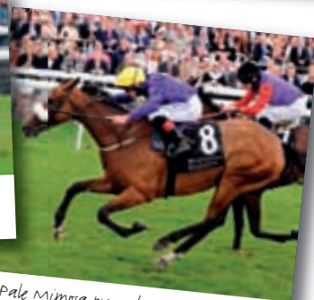
Pale Mimosa proves her staying power on the Knavesmire