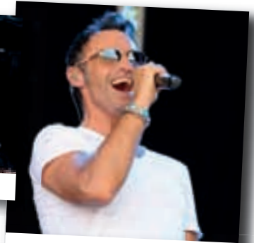
Marti Pellow brought smiles to thousands of faces, looks like it was mutual