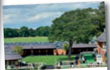
The new Northern End starts to look the part