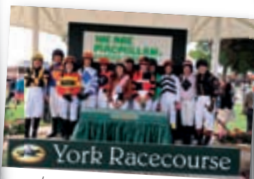
The 2014 Macmillan Charity Race contributes £50,000 to the £6.2 million raised by the day since the 1920s - thank you