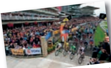
More world class sport as The Tour de France departs grandly