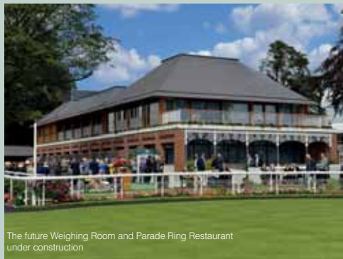
The future Weighing Room and Parade Ring Restaurant under construction