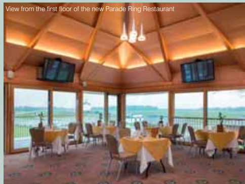
View from the first floor of the new Parade Ring Restaurant

Our thanks to everyone on the project and build team including main contractor Lindum of York, another few busy months lie ahead!